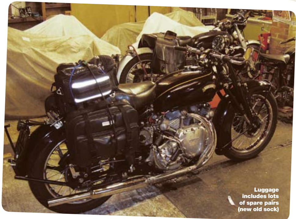
Luggage includes lots of spare pairs (new old sock)