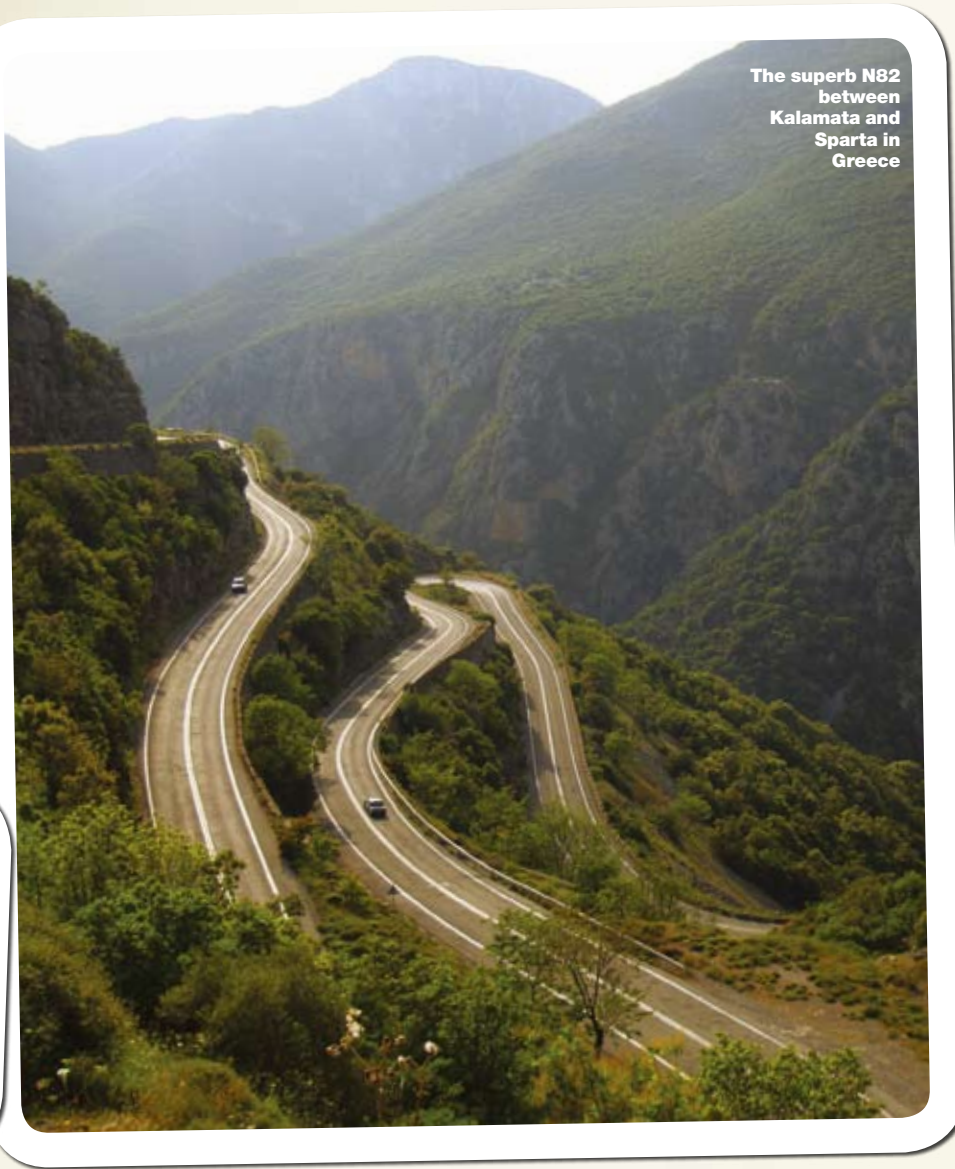
The superb N82 between Kalamata and Sparta in Greece